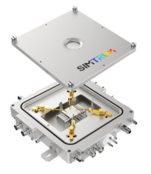
Fixed Probe Pin

Based on the optical temperature stage, an electrical module has been added. By moving the needle pin during testing, the tip of the needle can be brought into contact with any area of the sample surface. The electrical signal is transmitted to the instrumentation for electrical testing through the wiring connected to the needle holder, and the electrical properties of the material at variable temperatures are analyzed.