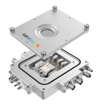
Magnet Micro Probe Pin