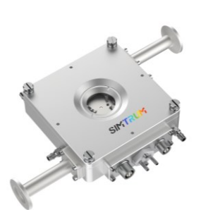
Vacuum Pumps up to 10<sup>-3</sup>mbar