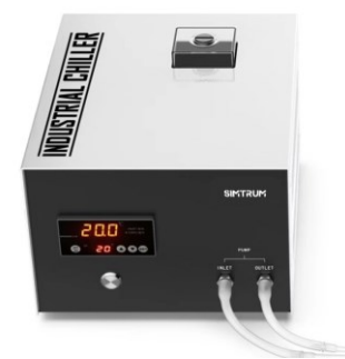
Water circulating system (temperature control)

The water circulation system is needed for Ultra-low or Hightemperature environments. It attaches to the Temperature stage chamber