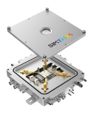
Fixed Probe Pin + Magnet Probe Pin